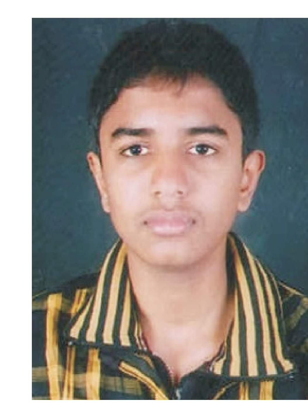
Kinnur Mahen Siddharaj PINNACLE Integrated program App No. 1409360 Hall Ticket No.X2920299 Class. XII