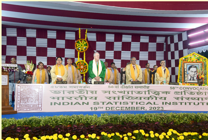
The 58th Convocation of the Indian Statistical Institute